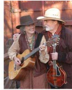
Tails and Rails

Cowboy Poetry Gathering in Elko, Nevada, in 1990 and returned in 1991, 1992, and 2007.